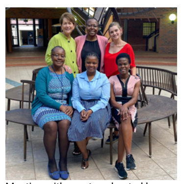
Meeting with grantees hosted by University of Pretoria

MMEG grants go further than ever, thanks to partnerships negotiated with South Africa's University of Pretoria and University of Cape Town (UCT). In recognition of MMEG's rigorous selection process, these schools agreed to contribute 50% of the cost of five grants over three years for grantees selected from their schools. And UCT generously agreed to co-sponsor a third student grantee, for a total of six co-sponsored grants.